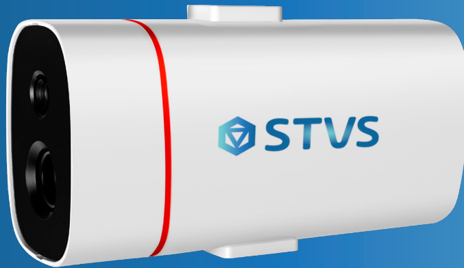
BINOCULAR THERMAL CAMERA

Easy to deploy, unpack and operate • Cost-effective Integrated Solution