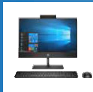
ALL IN ONE PC